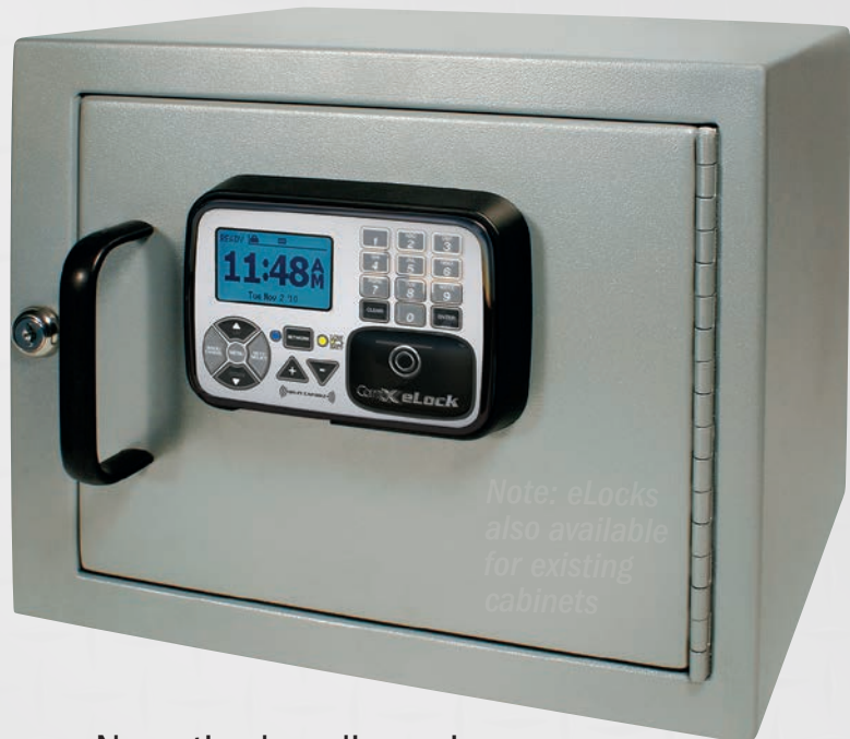
Narcotics box dimensions with CompX eLock installed