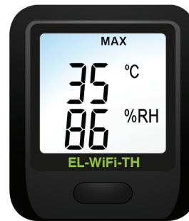
2) MAXIMUM RECORDED VALUES SINCE LAST RESET