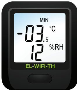
3) MINIMUM RECORDED VALUES SINCE LAST RESET