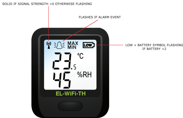
1) NORMAL DISPLAY - CURRENT TEMPERATURE