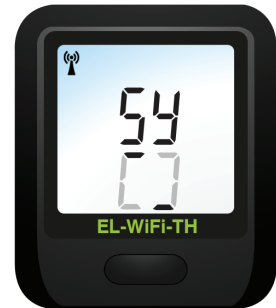
5) DATA SYNCING