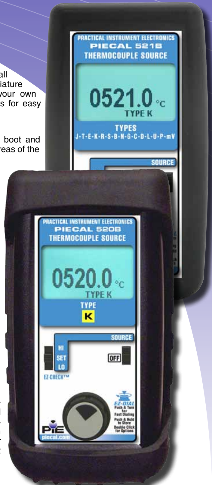
Actual Size (Shown with optional boot)