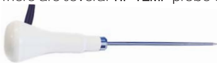
PT22M/W Penetration Probe (3.3mm) Temperature range: -100° to +250°C (-148° to +482°F)

There are several TIP TEMP probe options to use for temperature measurement: